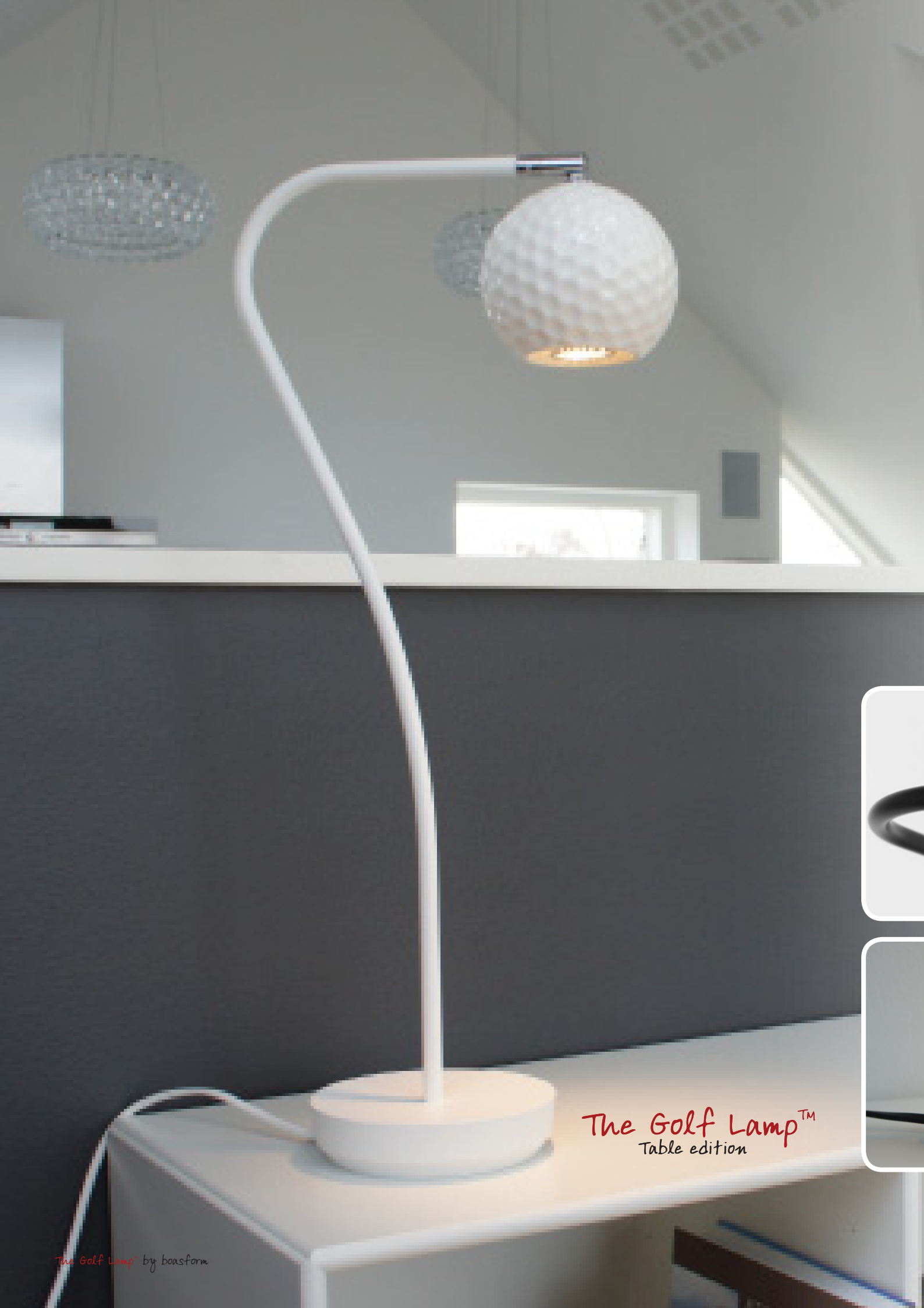
The Golf Lamp™ Table edition