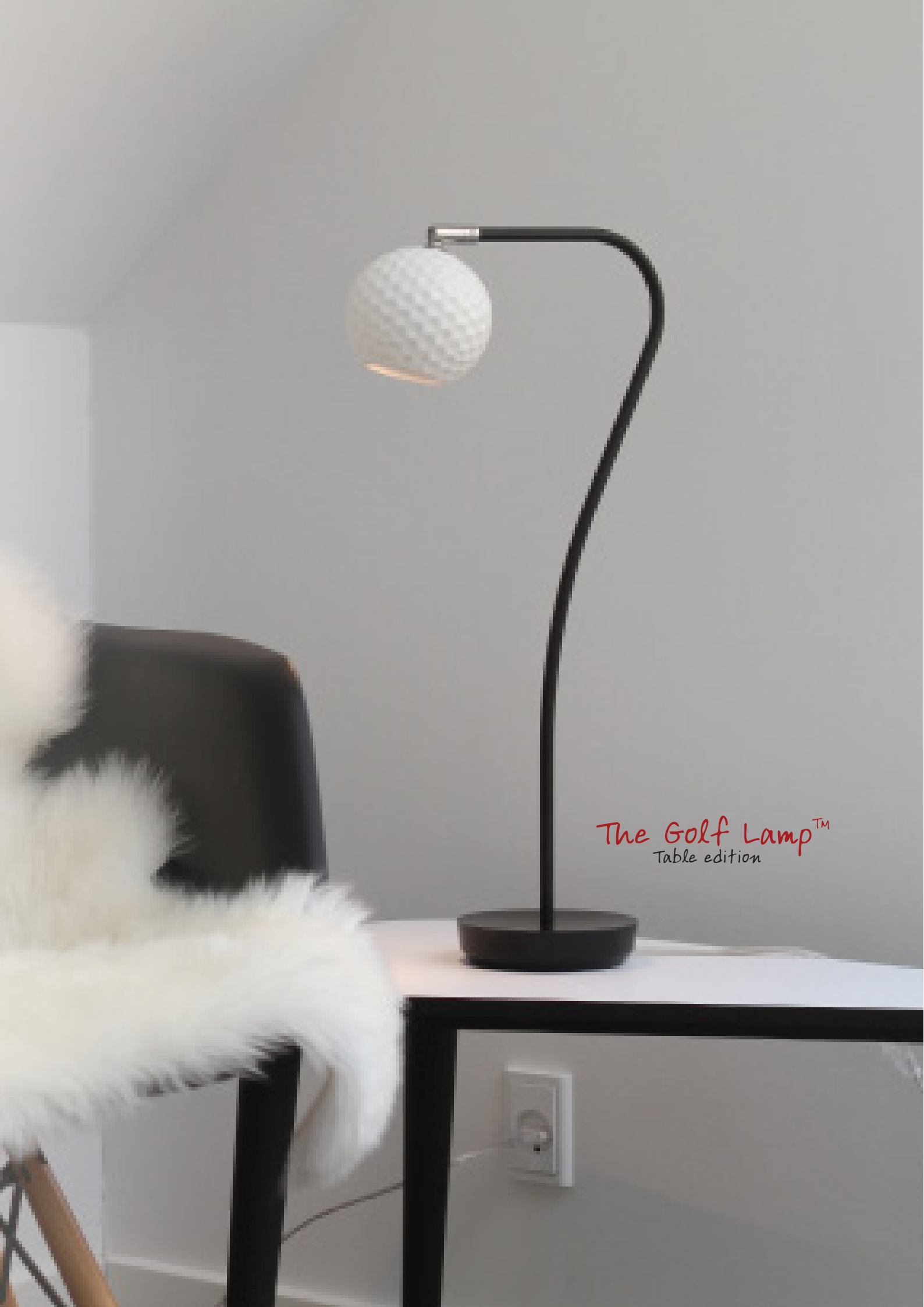
The Golf Lamp™ Table edition